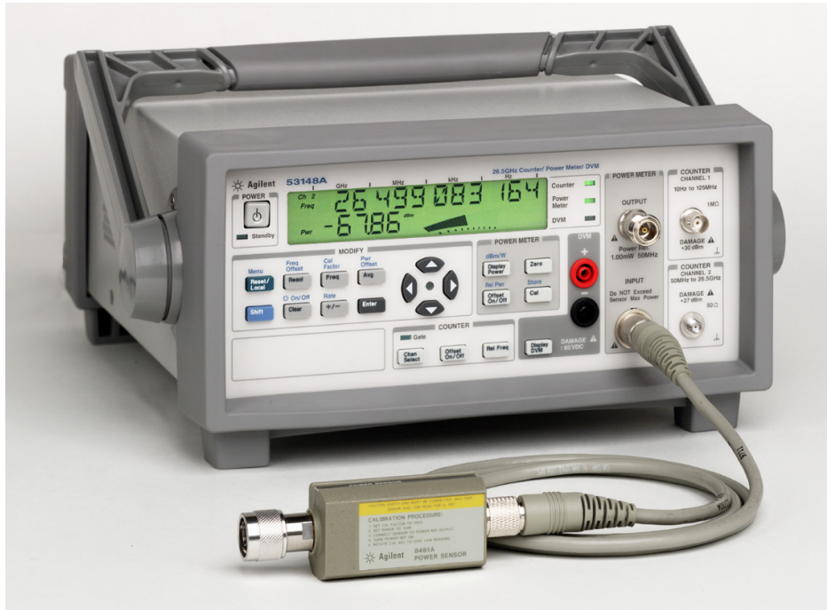
53140 Series microwave frequency Counter/Power meter/DVM